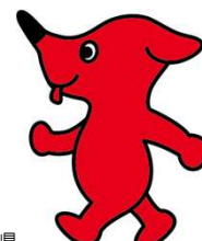
千葉県 マスコットキャラクター チーバくん