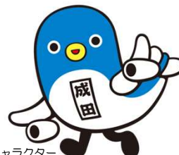
成田市 観光キャラクター うなりくん ©成田市2009

Only ETC-equipped vehicles are eligible for the Narita Smart IC. Vehicles without ETC cannot use this interchange.