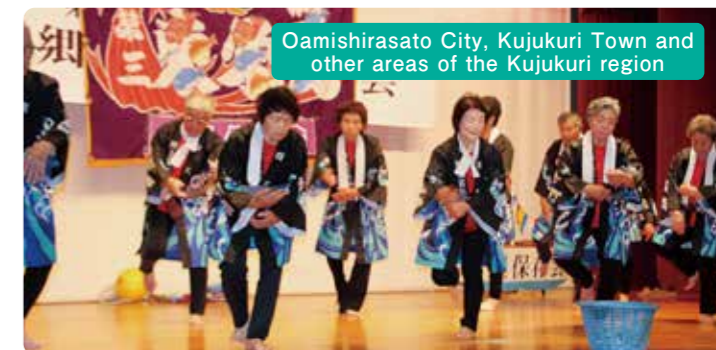
Oamishirasato City, Kujukuri Town and other areas of the Kujukuri region

[Tamasaki Shrine] A 3048 Ichinomiya, Ichinomiya Town, Chosei-gun ¥ Free to visit