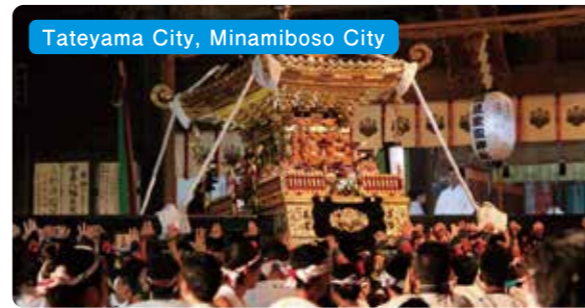
Tateyama City, Minamiboso City

Y Donation for Visiting (Junior high school students and older) ¥300