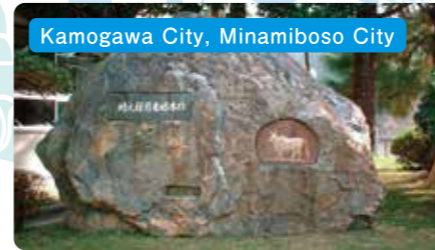
Kamogawa City, Minamiboso City