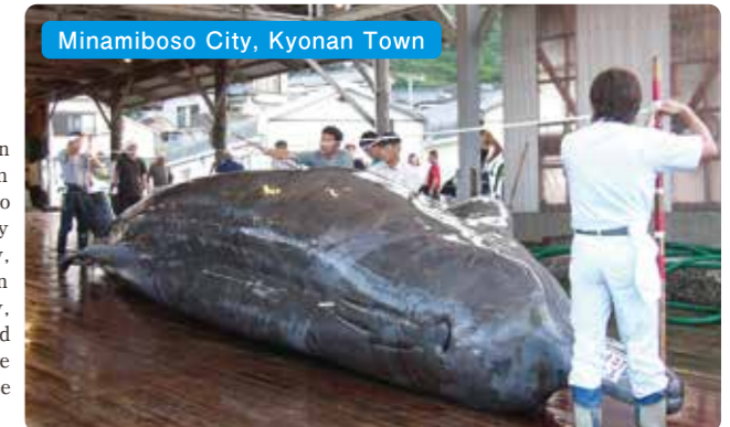
Minamiboso City, Kyonan Town

Whaling has been practiced in the Minamiboso area from Katsuyama in Kyonan Town to Wada-cho, Minamiboso City since the Edo period. Today, there is a whaling base in Wada-cho, Minamiboso City, where the whales are butchered and served with various whale dishes such as Kujira no Tare (Marinated Whale meat).