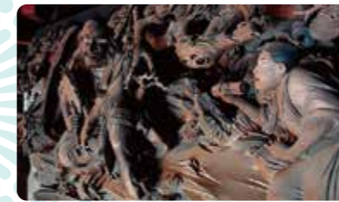
Kamogawa City, Minamiboso City, Isumi City, etc.

A coastal road extending about 46 km from a shimocho intersection in Tateyama City to the town of Wada in Minamiboso City. The approximately 6-km section from Ito to Aihama in Tateyama City has been selected as one of the 100 best roads in Japan, and its roadside is periodically colored by seasonal flowers.