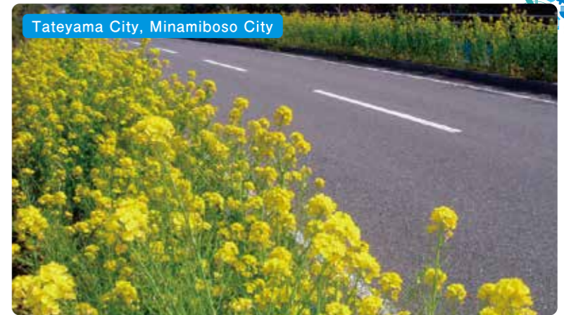
Tateyama City, Minamiboso City

A Along the Isumi Railway line in Isumi City and Otaki Town (Ohara Station to Kazusa-Nakano Station)