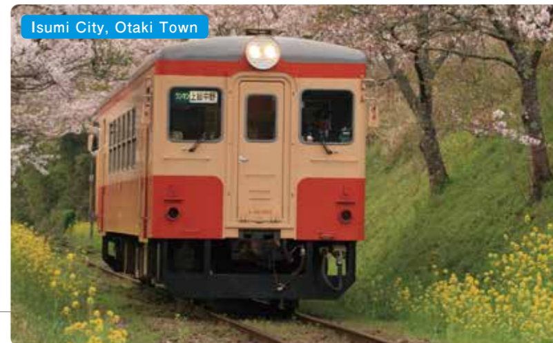
Isumi City, Otaki Town