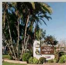
Fairview Developmental Center