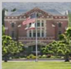
Sonoma Developmental Center

The 2015 May Revision to the Governor's Budget proposed the closures of the three remaining DCs--Sonoma, Fairview and the General Treatment Area of Porterville. The Department submitted a closure plan for SDC to the Legislature on October 1, 2015, with the goal of closing SDC by the end of 2018. Closure plans are in development for FDC and the GTA at PDC and will be submitted to the Legislature by April 1, 2016. See links below for more information on the closure planning for each facility.