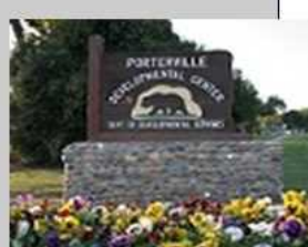
Porterville Developmental Center